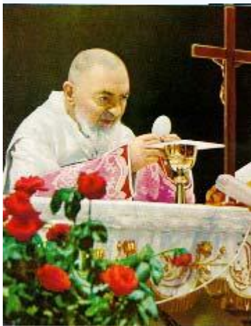
St. Padre Pio celebrating the Holy Mass

I was astonished to see my friend return to her pew surrounded by light, embraced by the Lord. I thought of the marvel that we miss so many times by going to receive Jesus with our small or large offences, when it should be a feast.